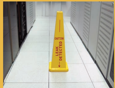
Raised floor computer facility