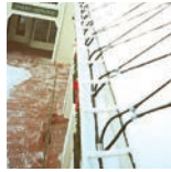
Snow Melting and De-Icing