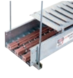
Fire and Performance Wiring