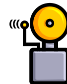
Alarm Siren (Relay Output)